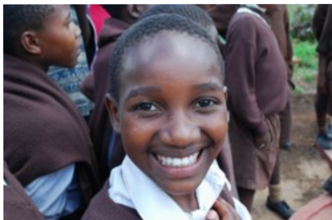
Water ... Happiness ...