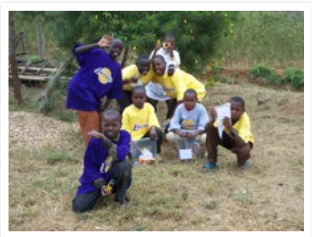
Boys with their Laker shirts and cameras