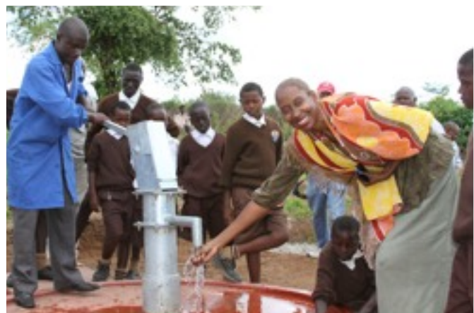
Living water ... aaahhhhh! Makueni, Kenya

2010 went by fast, didn't it? Before I knew it, I was sitting at my desk figuring out what to write to you and how to bring you up to date. Well, the biggest news is that the children finally have clean water thanks to Living Water International and our generous supporters. I flew out on Monday, November 22, 2010, arrived Tuesday evening, November 23, 2010 and pumped water for the first time on Thursday, November 25, 2010 - Thanksgiving Day. Indeed, what a day of thanksgiving it was. This was a very short stay for me, in that I had other obligations in the state and arrived back to California on December 1, 2010. Go to page 6 to see more pictures and the website for a complete report.