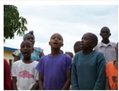
Immediate right: Children singing