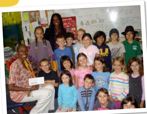
The Walden School - Receiving check 2009