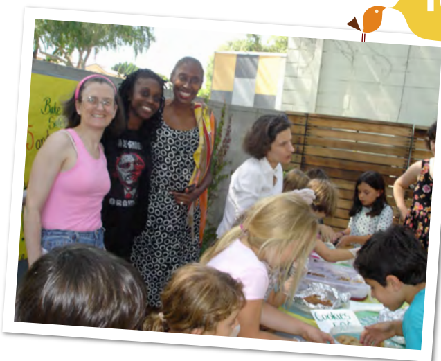
The Walden School - Bake Sale 2009